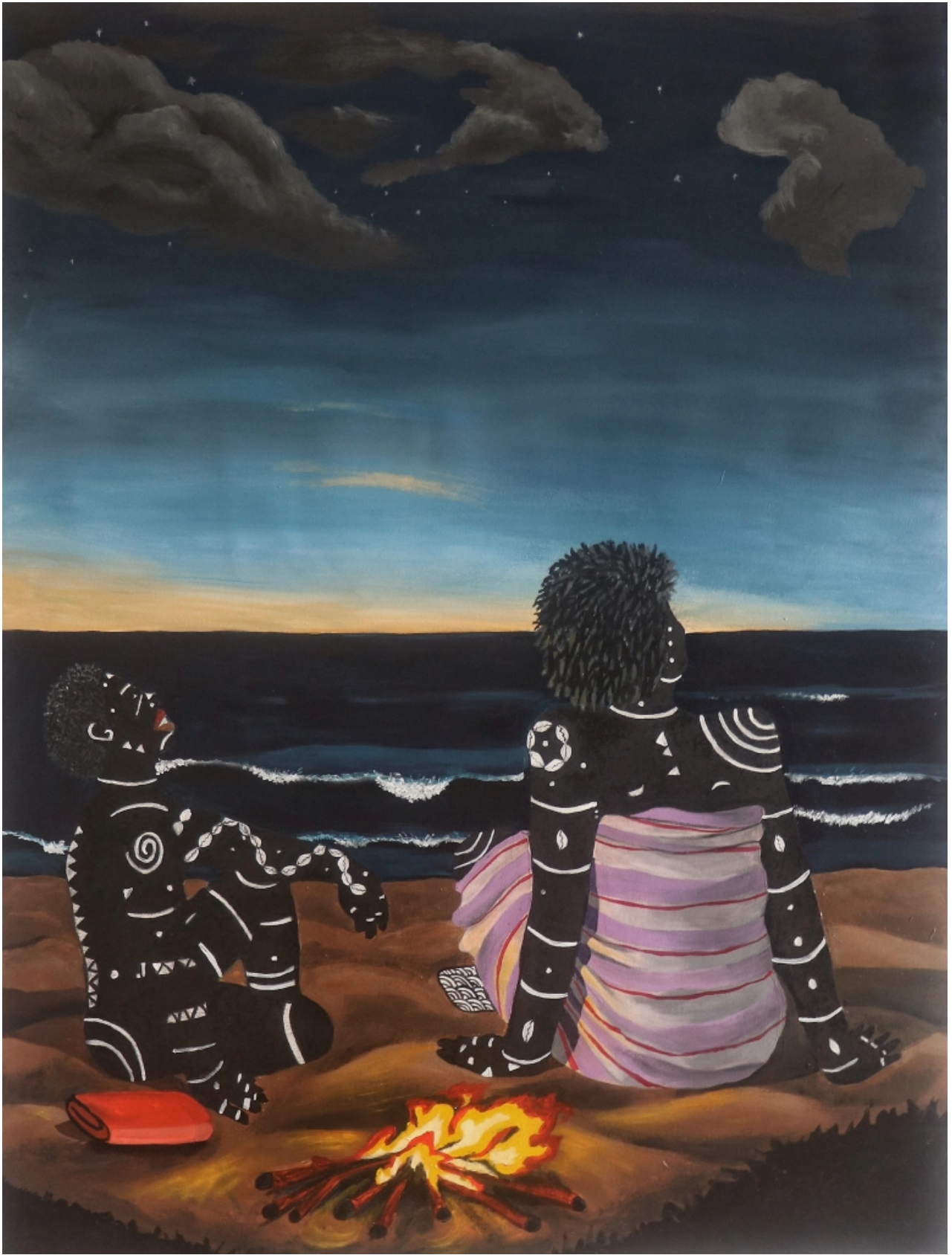
Midnight Walk 2 © Kelechi Nwaneri.