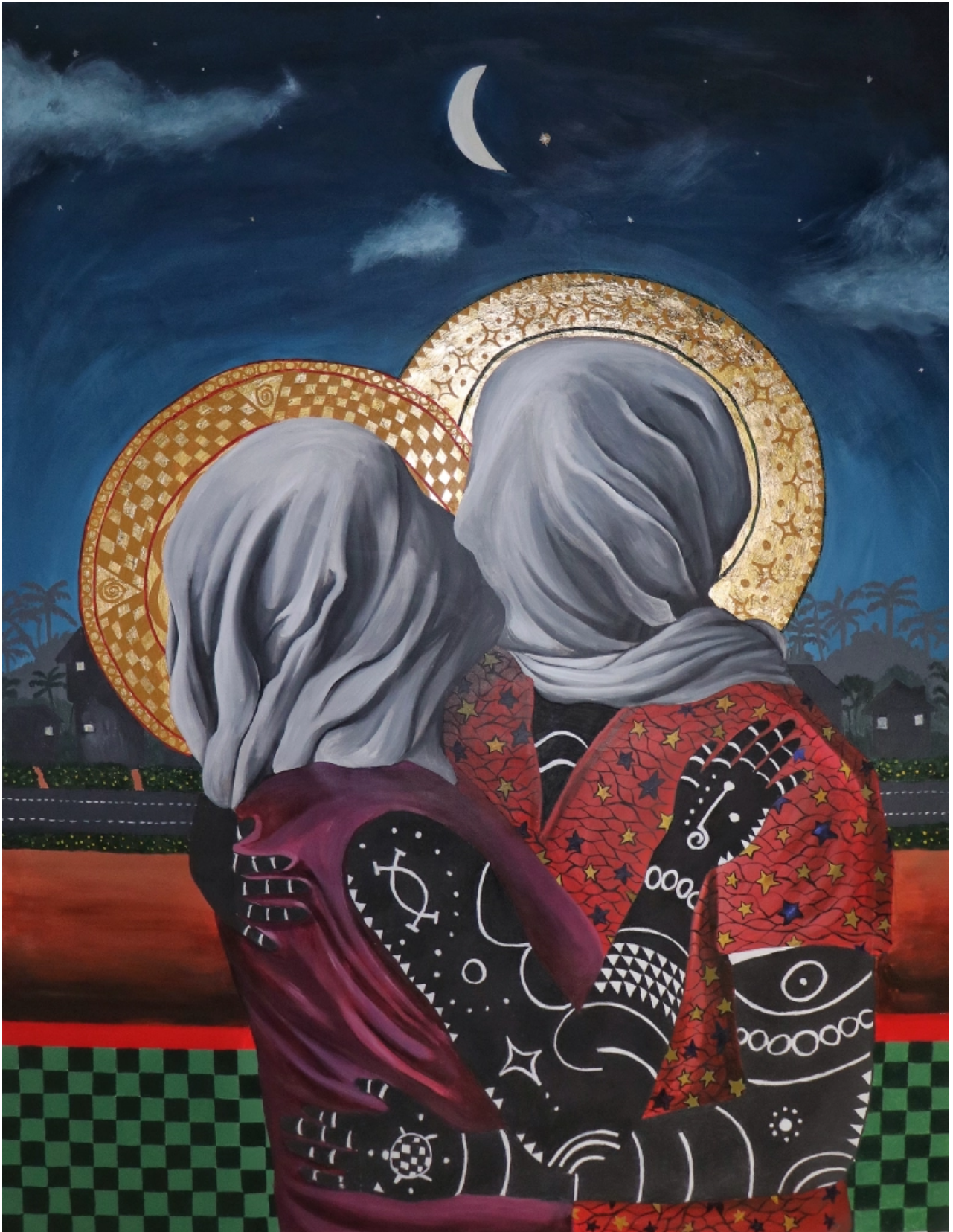
The Kiss © Kelechi Nwaneri.