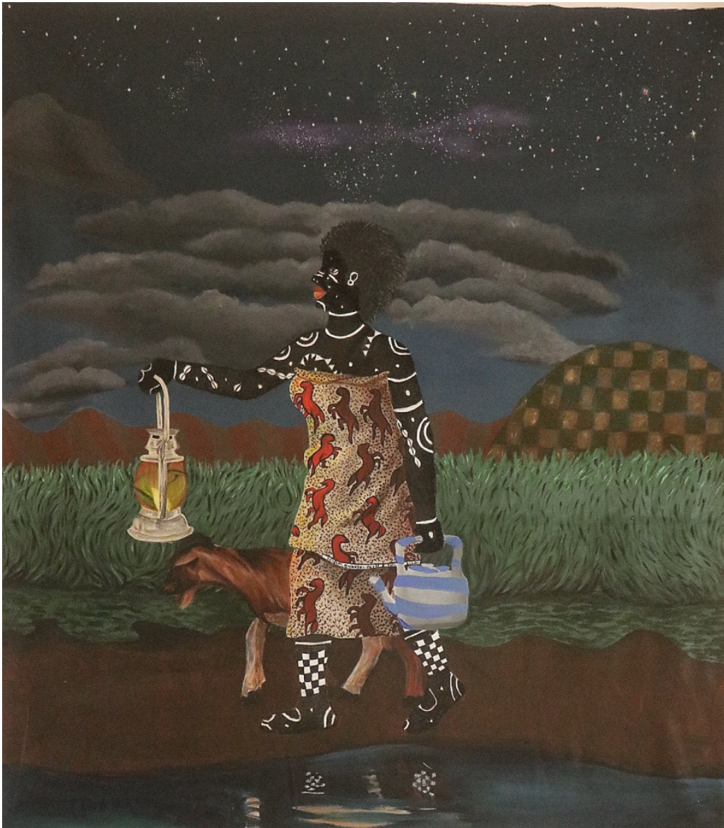
Search for Hope © Kelechi Nwaneri.