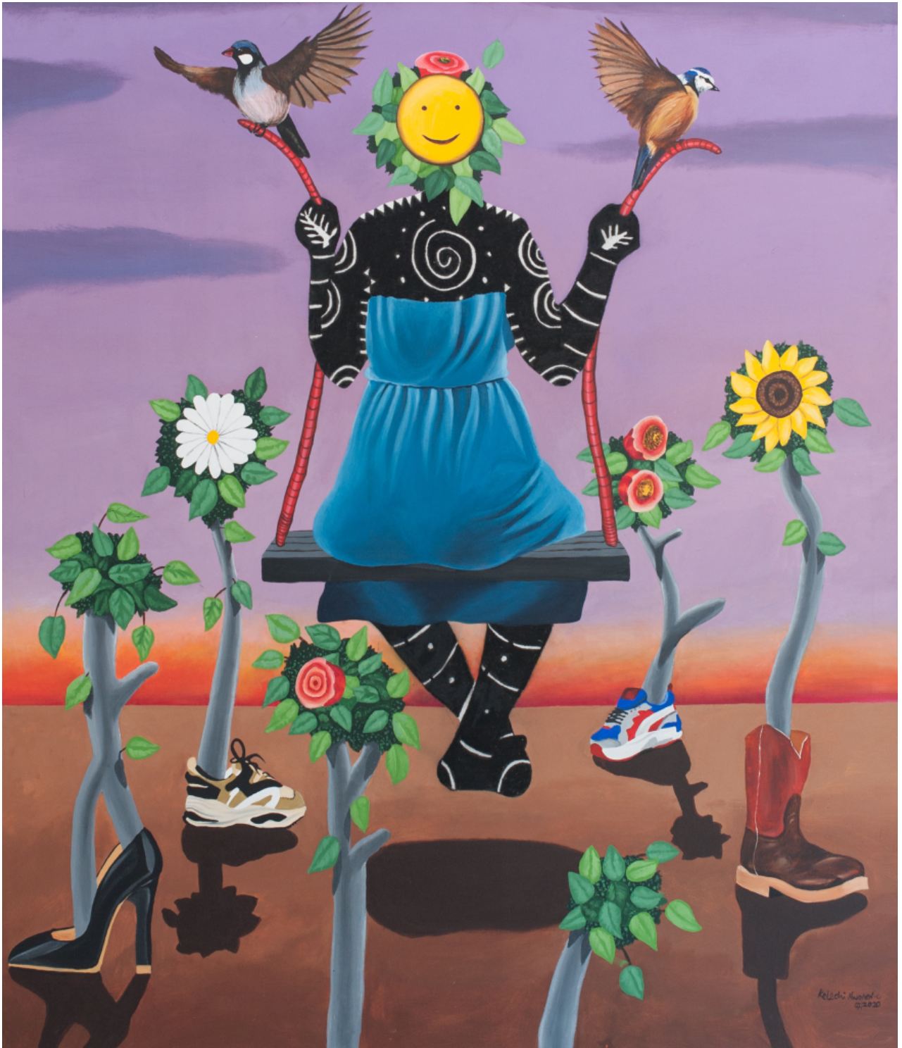
Force a Smile © Kelechi Nwaneri.