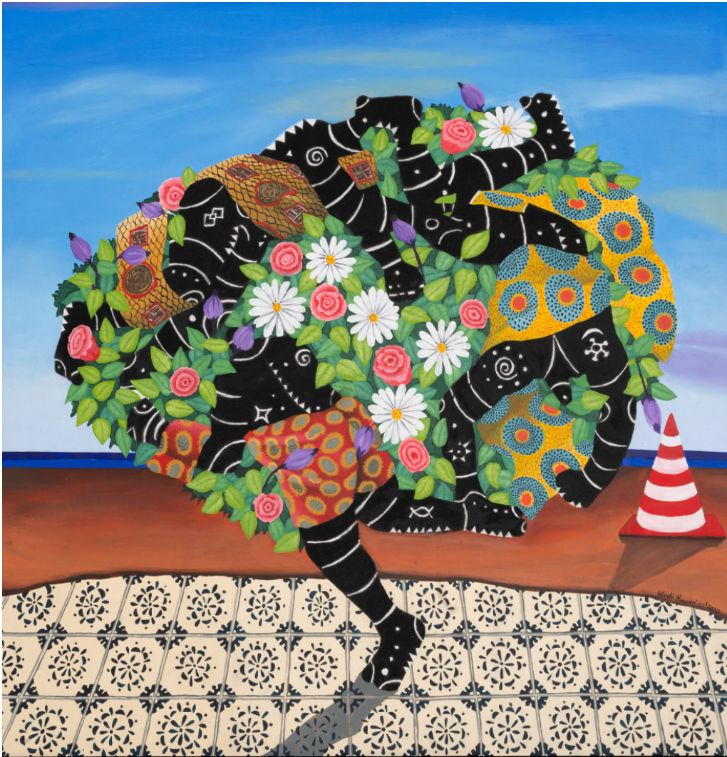
Portrait of a Human Brain