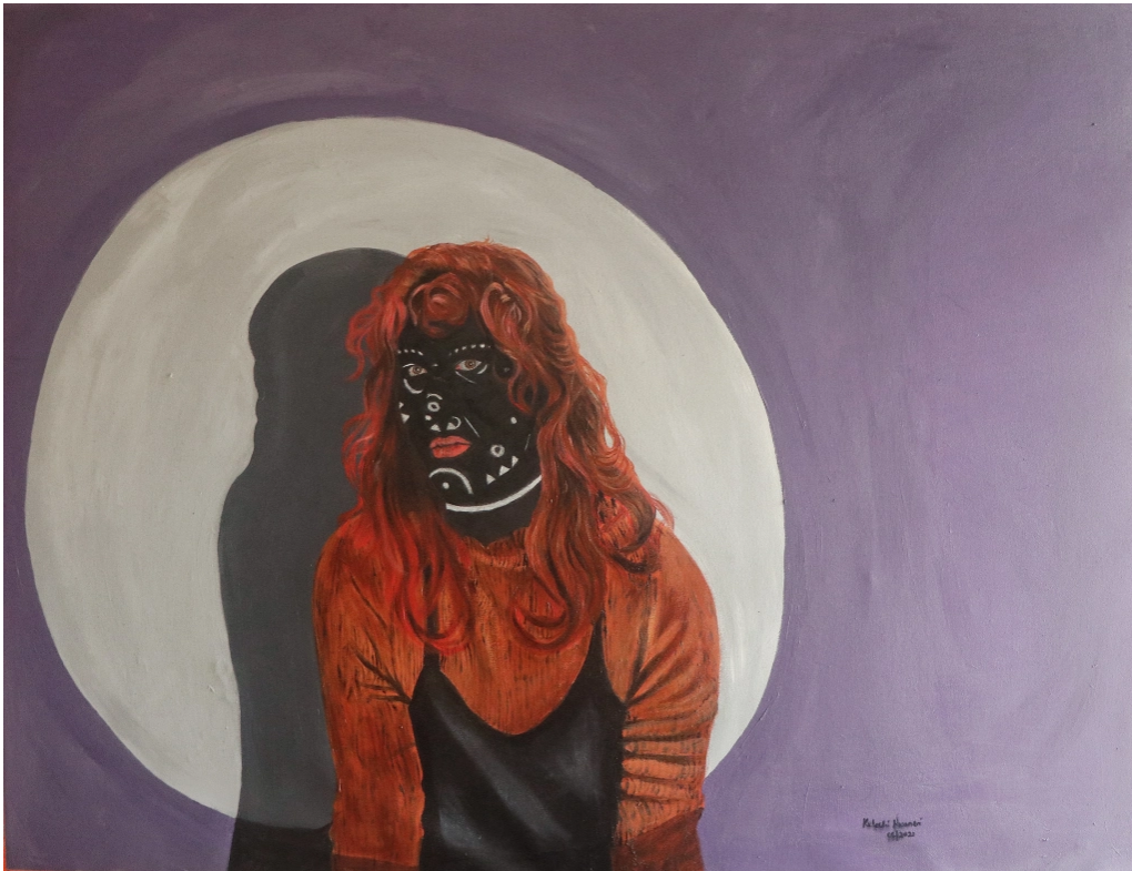
He is Her