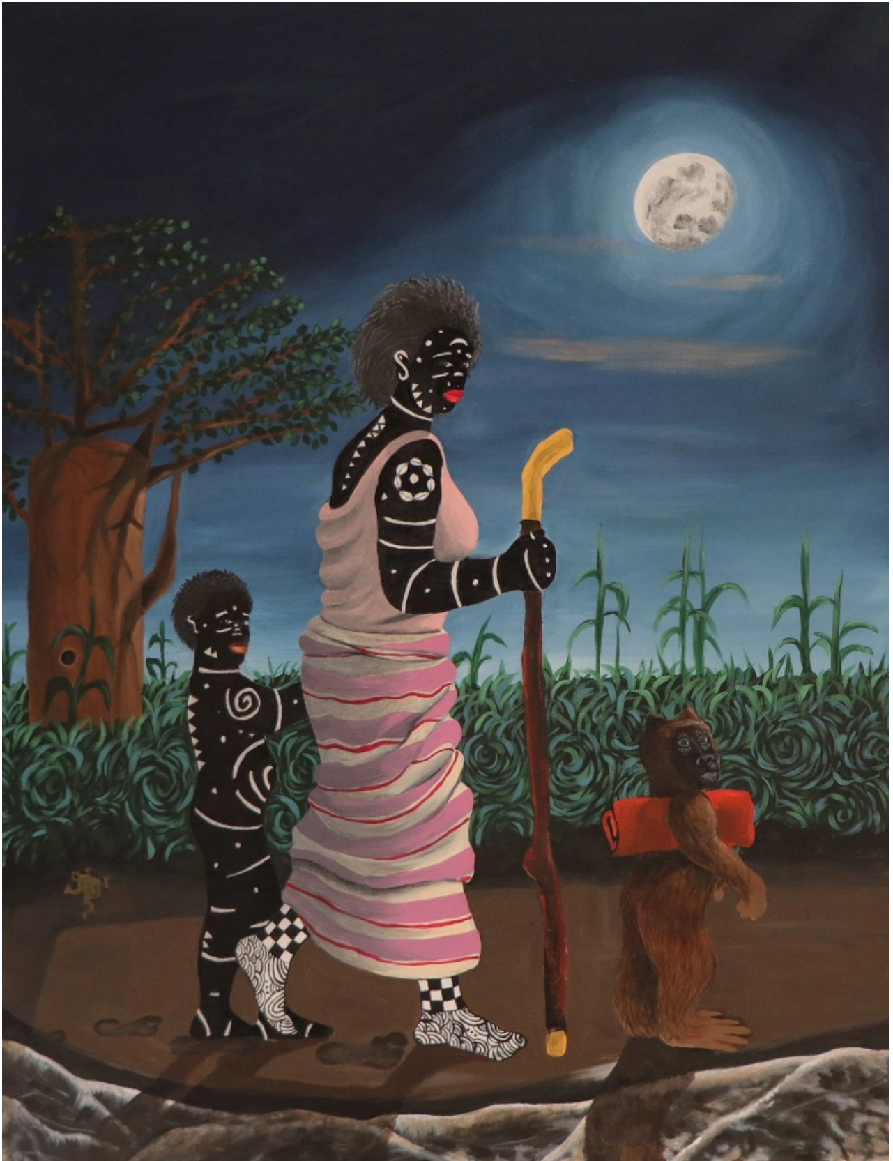
Midnight Walk 1 © Kelechi Nwaneri.