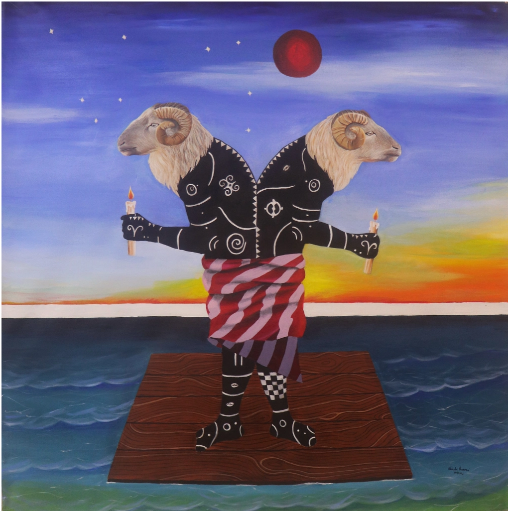
Aries © Kelechi Nwaneri.