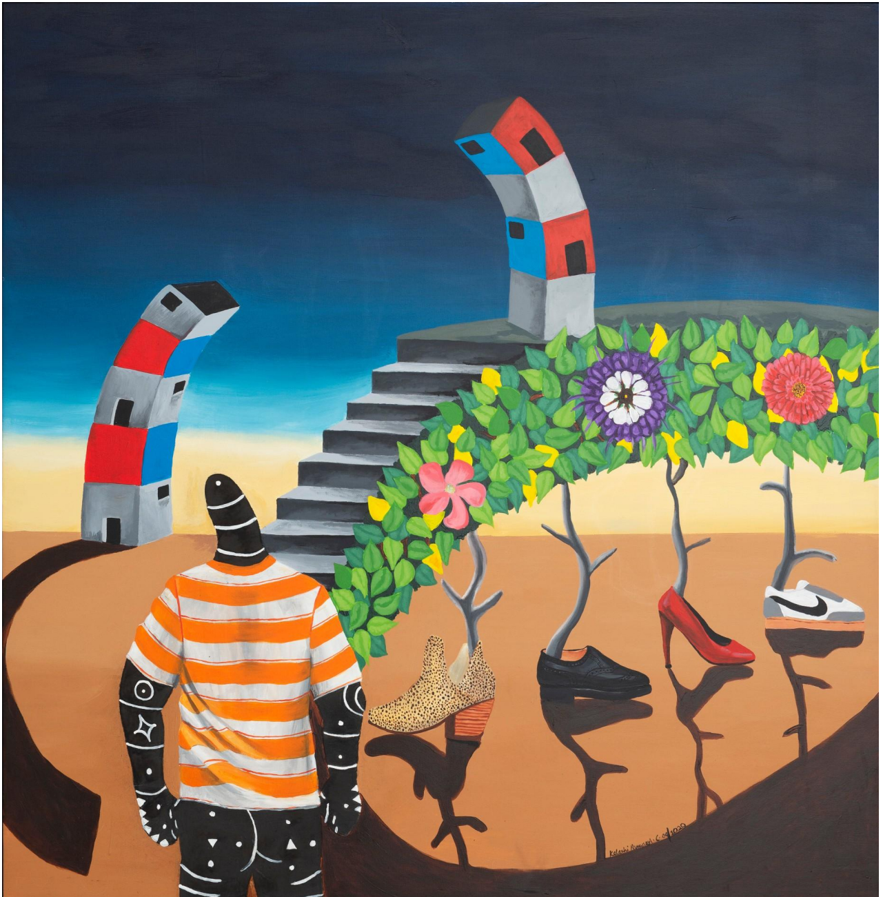
Empty Pockets, Dreams and Helpers © Kelechi Nwaneri.