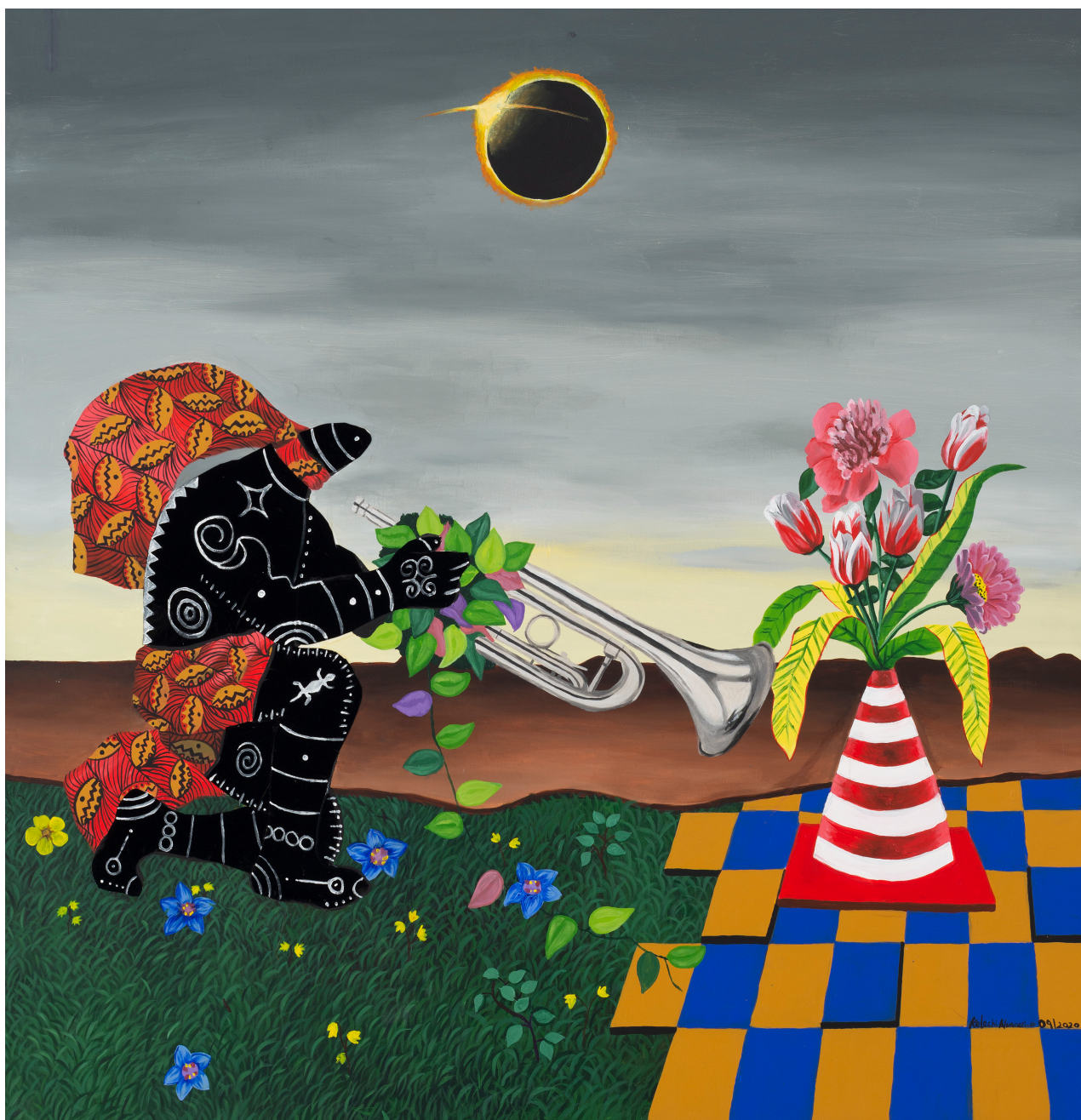
Serenade © Kelechi Nwaneri.

Links: Instagram ( www.instagram.com/kaecyart )