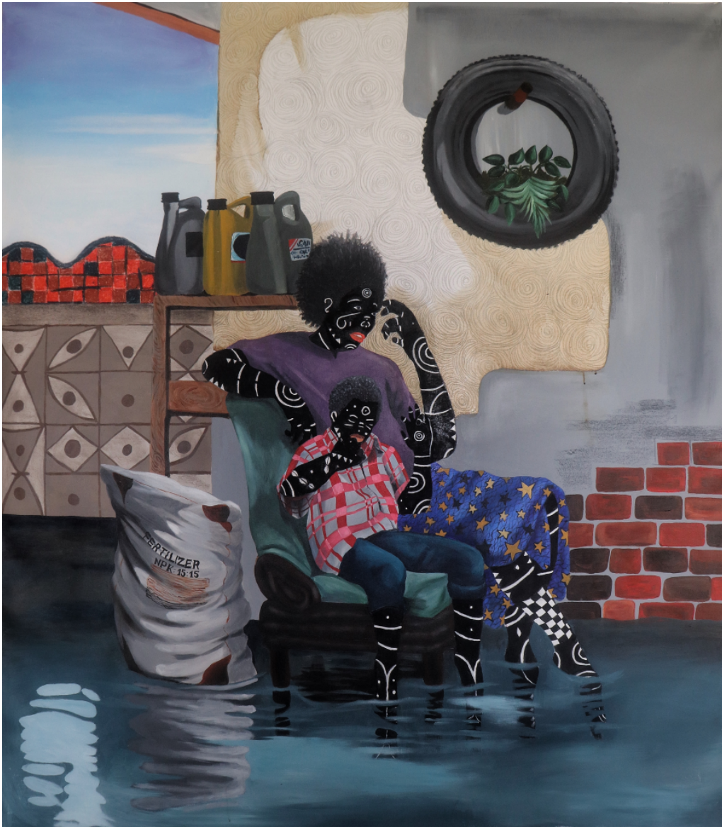
Flooded Apartment © Kelechi Nwaneri.