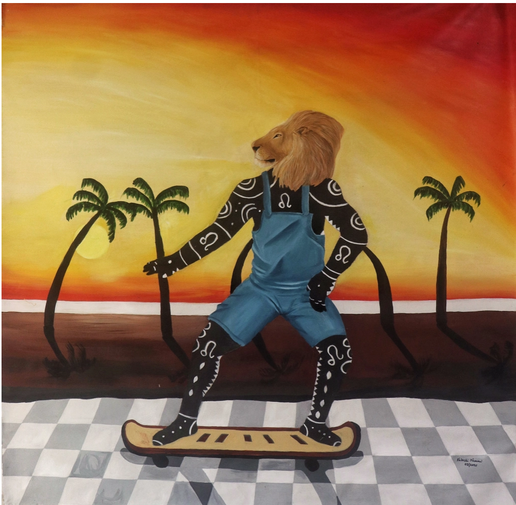
Leo