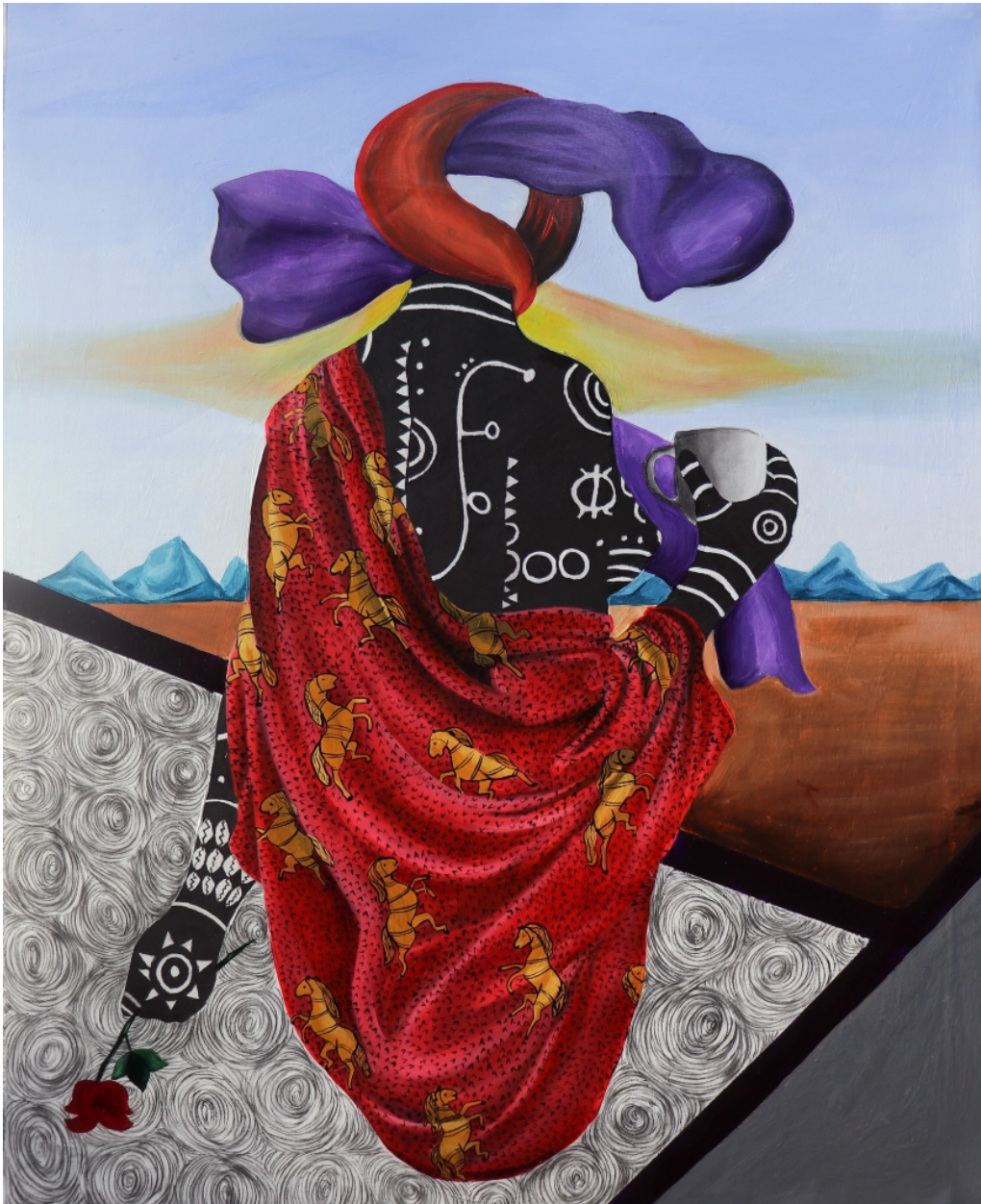
Portrait of a Human Heart