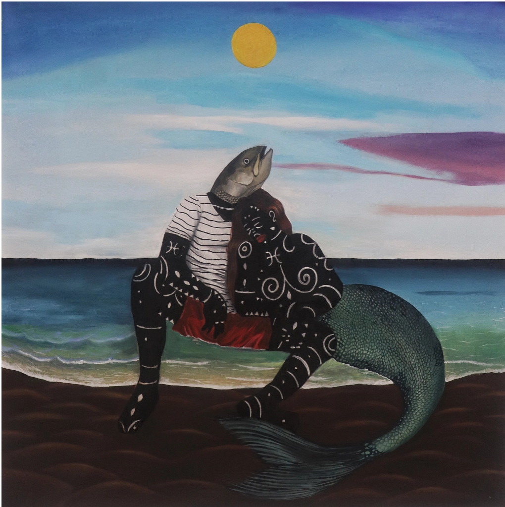
Pisces © Kelechi Nwaneri.