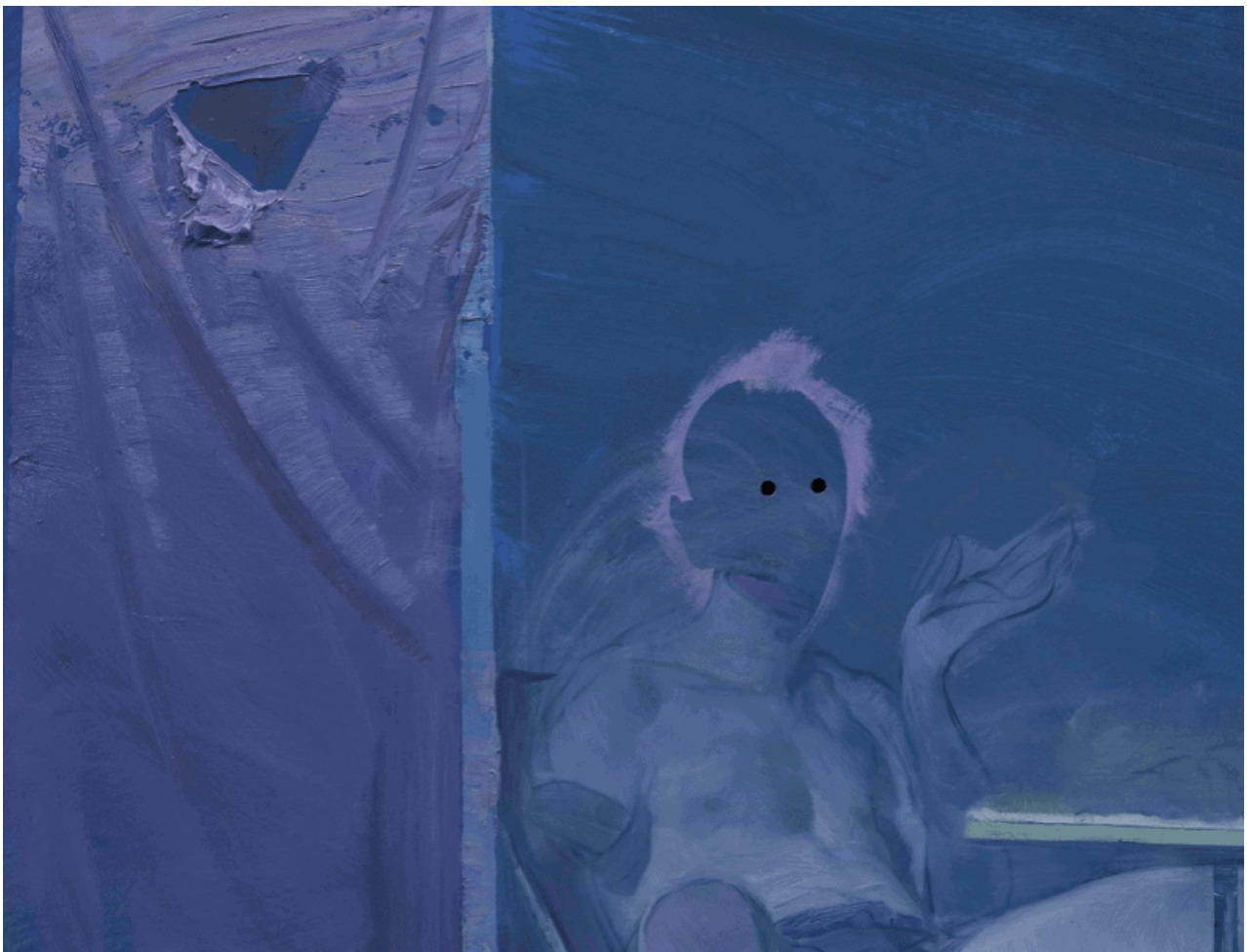
Ruprecht von Kaufmann, (detail of) Die Sache mit den Sirenen, 2014. Oil and collage on linoleum – 200 x 175 cm. Courtesy of the artist.

RVK: Blurring or erasing is a regular part of my painting practise. I want the paintings to have a certain rawness and fluidity that would get lost if I laboured too much over a certain section. So I often take a scraper and scratch out hole areas when I feel they have gotten too tight and too precise and then work back into the remnants of what was there before. That process of destroying and rebuilding can go on for quite a while. I want the failures still to be visible. To me the figures look more believable that way, because they are themselves flawed, like actual human beings. But leaving mistakes visible also allows a presence of vulnerability on my end. A true connection is only possible when you allow yourself to be vulnerable. And I want the paintings to connect with their audience.