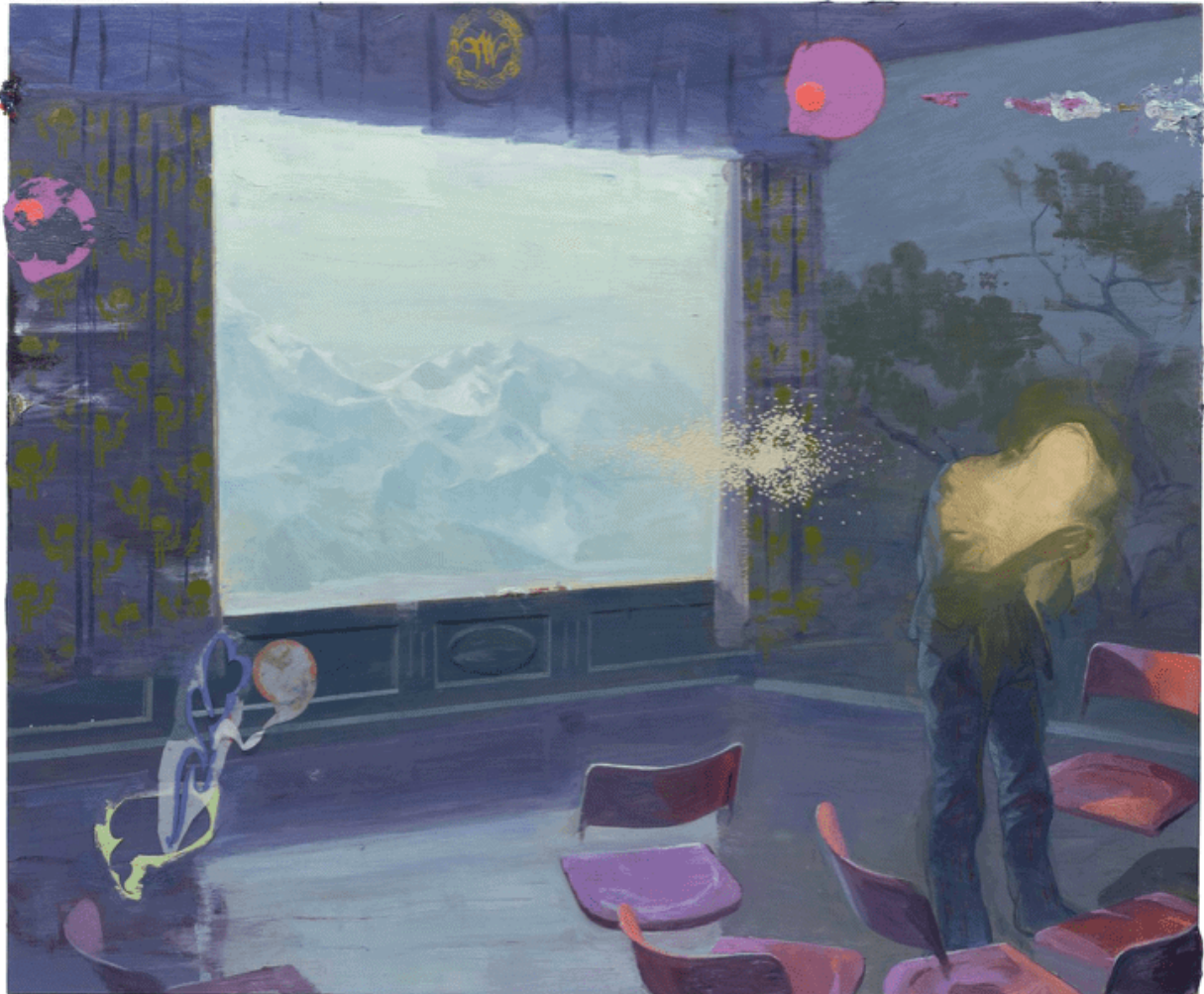
Ruprecht von Kaufmann, Der letzte Akt , 2019. Oil on linoleum on wood – 153 x 184 cm.

Even though the painting is kind of dark and moody, it's one that isn't meant to be all serious. Usually there is a lot of humour in my work. So I am glad that it makes you smile.