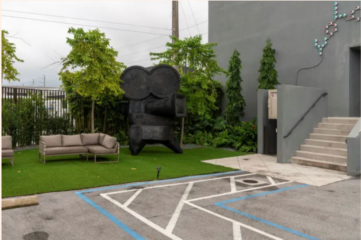
William Kentridge's work outside El Espacio 23 museum