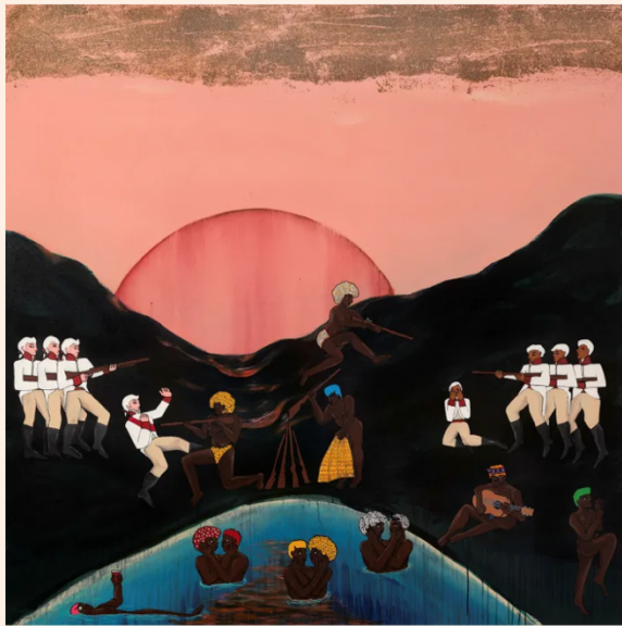
Umar Rashid, 'Incident at Lover's Cove' (2021)