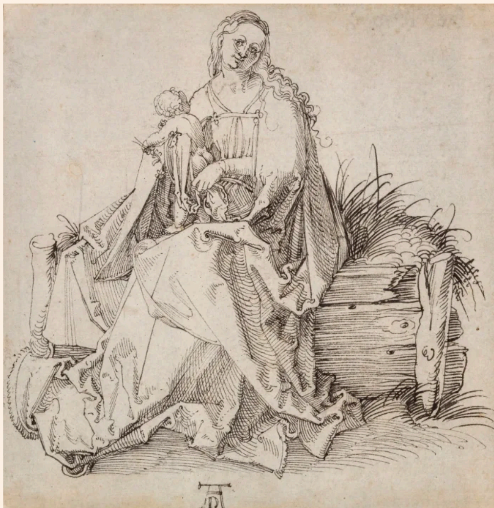
Albrecht Dürer, 'Virgin and Child' (1503)

Gagosian opened a gallery in Hong Kong's Pedder Building in 2011 but "is not looking for real estate elsewhere [in Asia]", Simunovic says. "It's easy to open a gallery but to programme it constantly is a big endeavour." Gagosian's Hong Kong space has already sold out its solo show by Jonas Wood, which opened last week, he says.