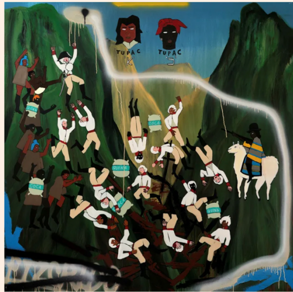
Umar Rashid's 'Tupac y Tupac, Time lords of the Andes. Or, a failed Fitzcarraldo' (2021)

Galleries with work at the lower end of the price scale also reported healthy sales, particularly with more politically charged work. Tiwani Contemporary sold out of its booth of 10 works based on an imagined empire by the African-American artist Umar Rashid ($25,000-$65,000).