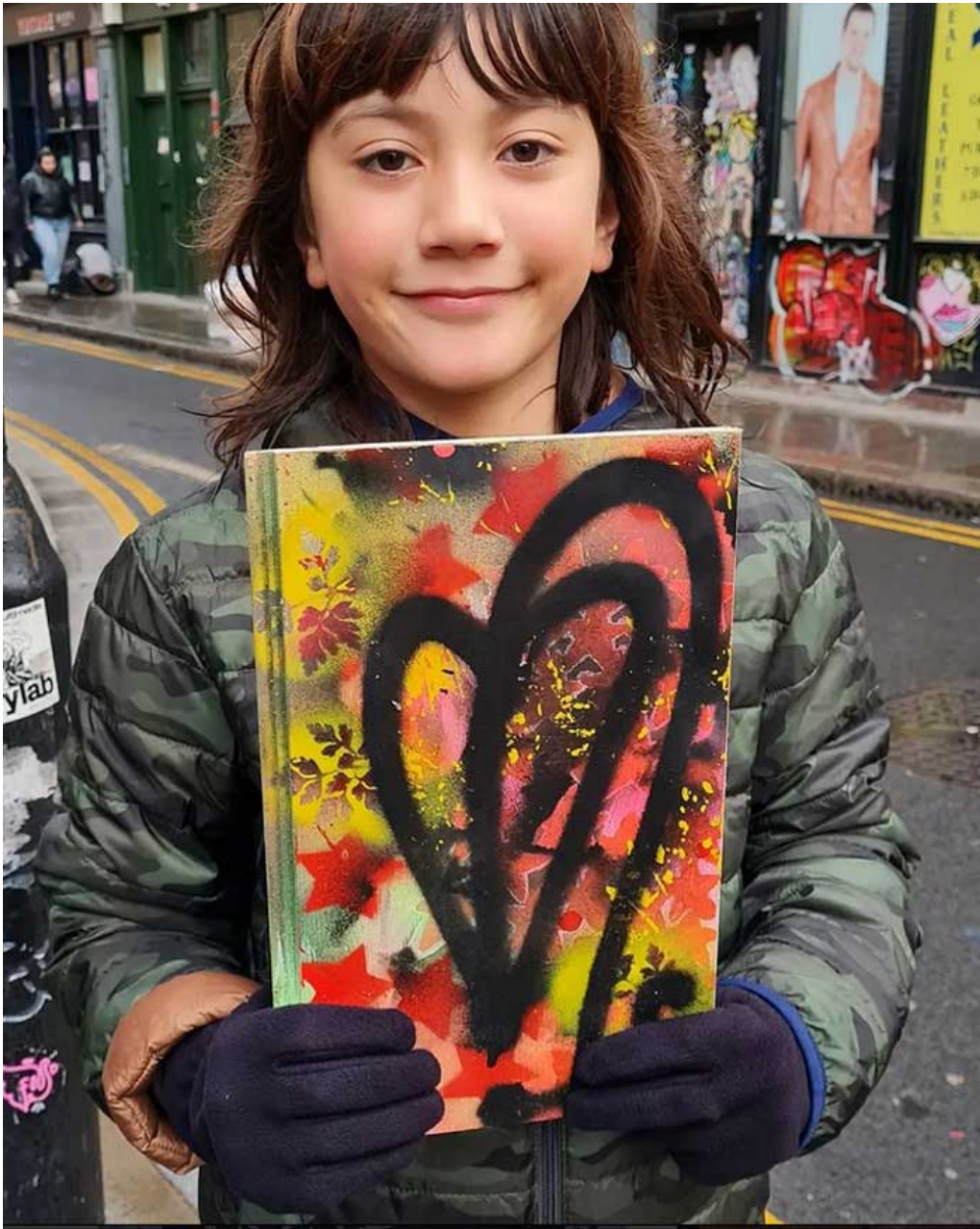
A #43leaves piece found....

Five more art things. five art things, five more art things happening somewhere around right now or any moment now. Five art shows to check out in the coming days. An (almost) weekly round up of recommended art events. Five shows, exhibitions or things