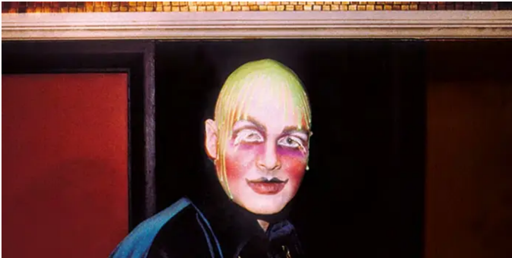
Leigh Bowery – Tell Them I've Go

2: Leigh Bowery – Tell Them I've Gone to Papua New Guinea – Fitzrovia Chapel, Friday 7th January until Friday 21st January 2022 – The Fitzrovia Chapel say they are “delighted to announce an exhibition to celebrate the life and work of renowned performance artist Leigh. The chapel is the only remaining building of the Middlesex Hospital, where Leigh died from AIDS on New Year’s Eve 1994. Leigh is a legendary figure who spans the worlds of art, fashion, dance, club and music. Essentially he himself was the living breathing work of art, his now iconic designs and costumes were ubiquitous and meant for Leigh, as he pushed his body through ever more extreme creations, designed to shock and thrill onlookers from dance floor to gallery. He was also known as one of Lucian Freud’s most famous models, sitting for the renowned painter for several years and becoming close friends, his large naked bald form becoming almost as recognisable as when wearing his own outlandish and ornately decorated costumes and creations. Leigh died of AIDS on New Year’s Eve 1994, shortly after his last performance at the Freedom Cafe, Soho in November, where people saw for the last time his legendary ‘Birth’ performance where he gave birth to his assistant and close friend Nicola Bateman live on stage, with Freud, Alexander McQueen and his other close friend Sue Tilley all on the front row”.