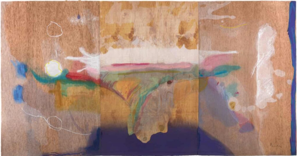
Helen Frankenthaler: 'Madame Butterfly', 2000

People quite often ask me what galleries I recommend. For the last few weeks, and quite possibly the next few weeks too, I've put the Dulwich Picture Gallery top of my list. It's a fine building in a pleasant setting with a good café, and as for the art: