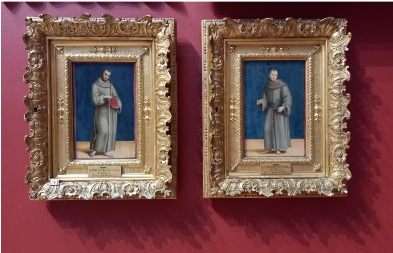
Raphael: St Francis of Assisi and St Anthony of Padua, c. 1504