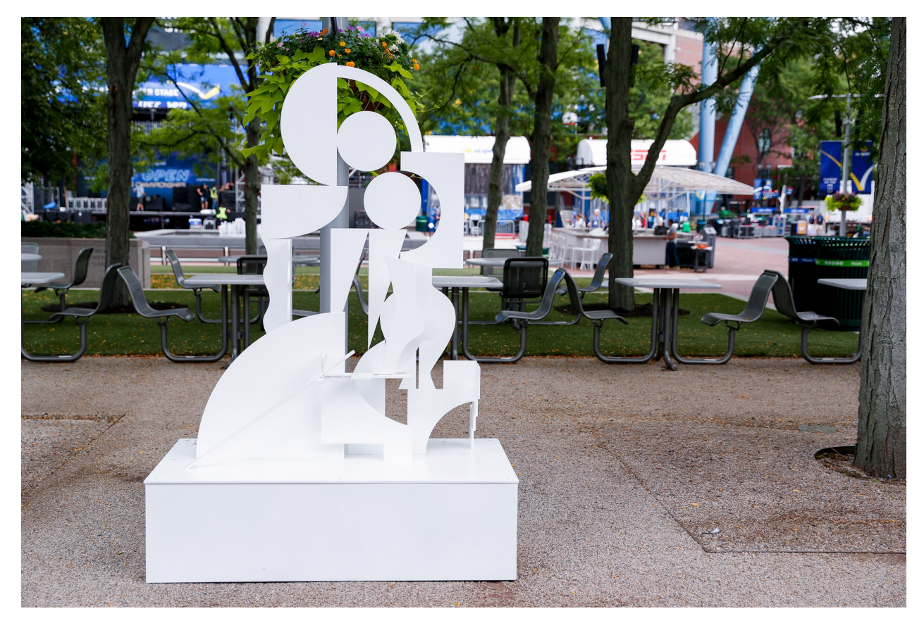
Carolyn Salas, Tippy Toes, 2021. Water Jet Cut and Powder-Coated Aluminum. Sculpture: 78 x 30 x 54 1/4 in. 198.1 x 76.2 x 137.8 cm. Base: 15 x 54 x 30 in. 38.1 x 137.16 x 76.2 cm. Edition of 3 plus 2 AP.