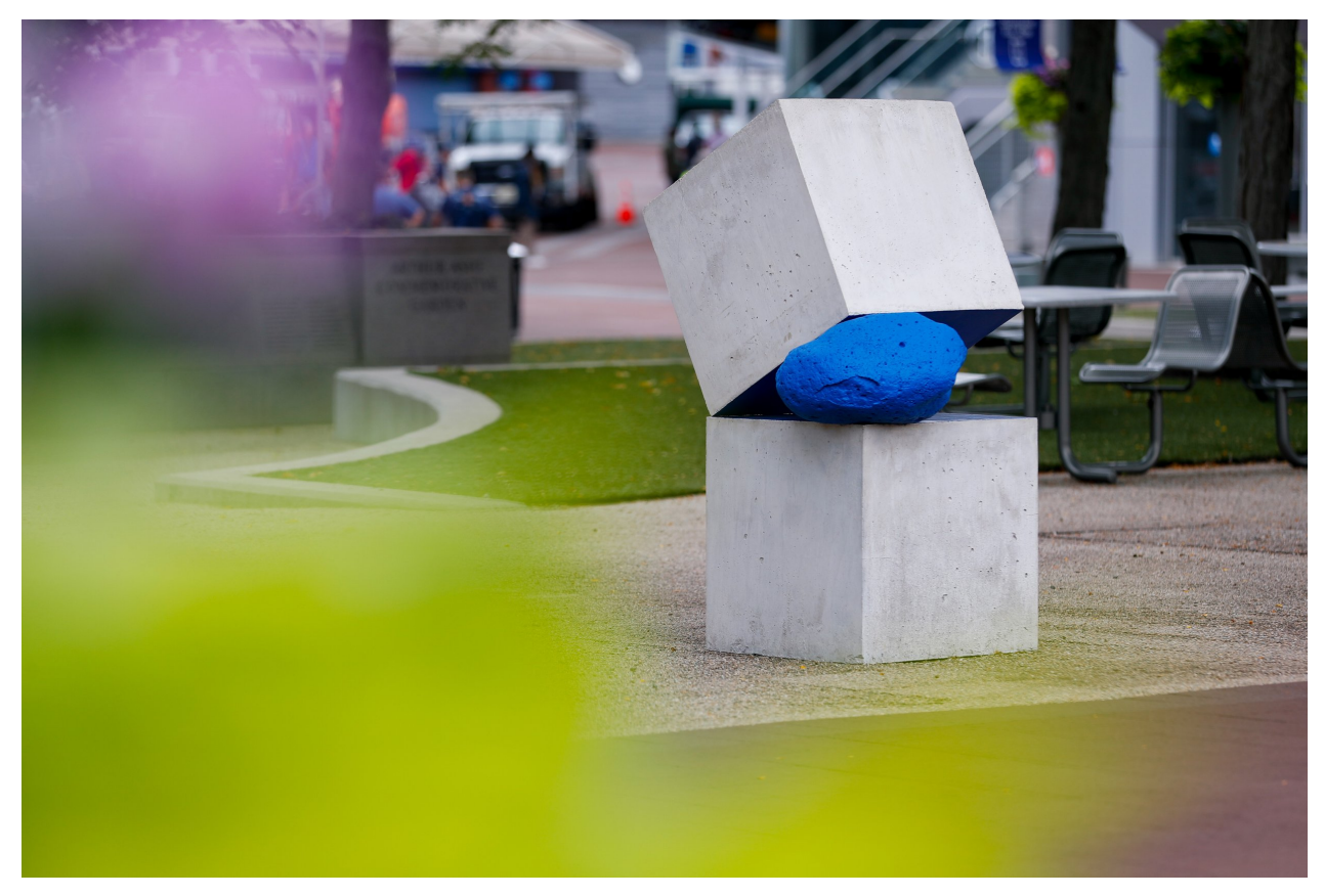
Jose Dávila, Untitled, 2021. Concrete, Boulder and Epoxy Paint. 55 8/16 x 29 15/16 x 40 1/16 cm. © Jose Dávila.